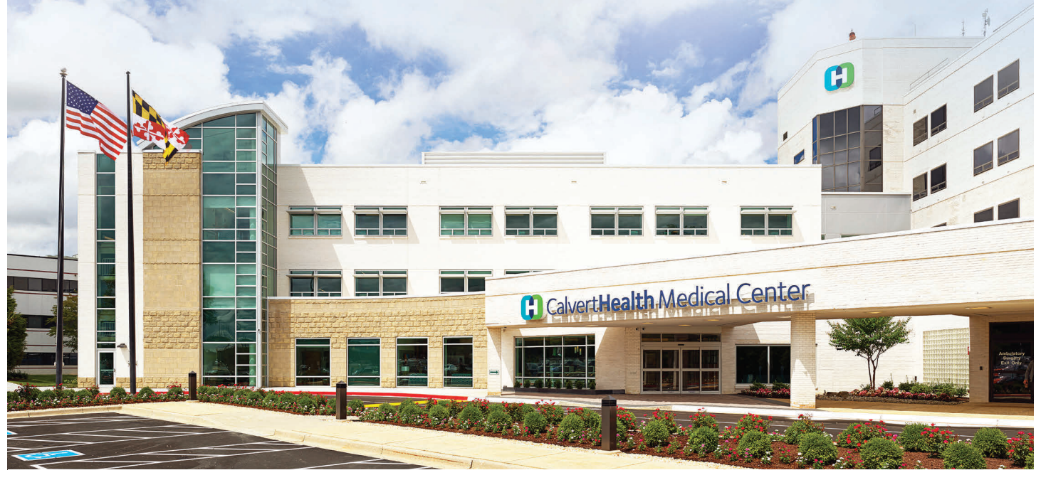
In 2019 CalvertHealth completed Phase I of the $51-million expansion to add private patient rooms to Levels 2 and 3. Phase II, to renovate the existing rooms on those levels, is underway and expected to be complete later this year.

The names listed are those who supported the Building on a Century of Care campaign to raise more than $4-million toward the $51-million project and bring private patient rooms to our medical and surgical patients. We are incredibly humbled by the outpouring of support for your local, community hospital. As we enter the next century of providing health care to our community, one thing remains the same – a dedication to do our best every day while making a difference in every life we touch.